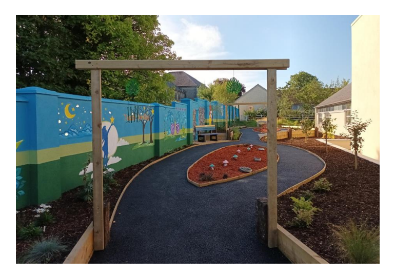
Sacred Heart Primary School, Granard: sensory garden