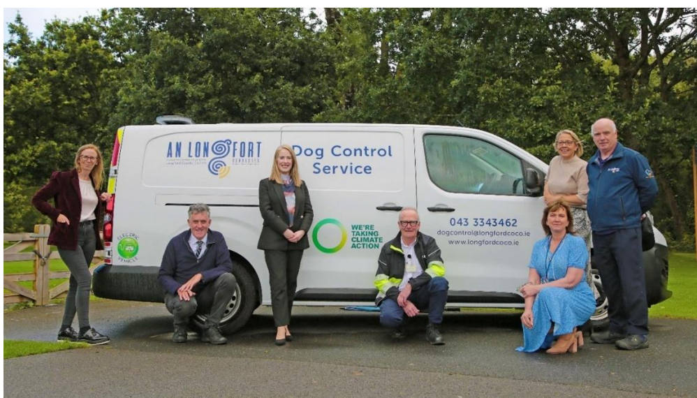
Photo – New eExpert Peugeot electric van purchased in 2024 for the dog warden service.

Decarbonising the fleet is the biggest single challenge facing the Council to reaching its Carbon emission targets in the coming years.