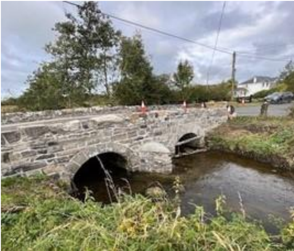
Photo – rehabilitated bridge at Liscahill-Gneeve 2024

The cost of the programme in 2024 was €433,350.