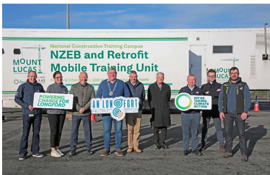
Photo – opening of the LOETB Energy Roadshow at Connolly's Barrack

Energy Road Show - Longford County Council hosted the Laois Offaly Educational Training Boards' (LOETB) Energy Roadshow from the 25 th to the 29 th of November. The roadshow was attended by over 300 people and it focused on energy retrofitting for homes and businesses.