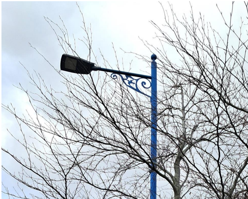
Photo – new LED light installed in Newtowncashel

296 lamps were upgraded in 2024, saving a further 89,065 KWh/year and 45 tonnes of CO2.