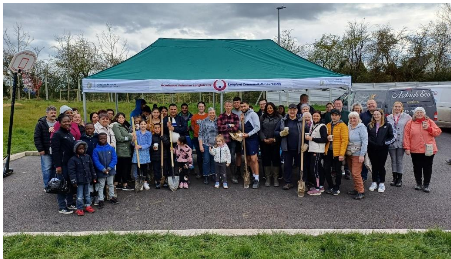
Photo - New Tree Planting at Alderfield

At the new Alderfield housing estate, Longford County Council along with LCRL and the local community got together 3/04/2024 to plant 300 tree urban forest on a green area between the housing estate and Longford Golf Club . This urban forest initiative is a boon for Carbon capture, biodiversity and social inclusion through environmental enhancement.