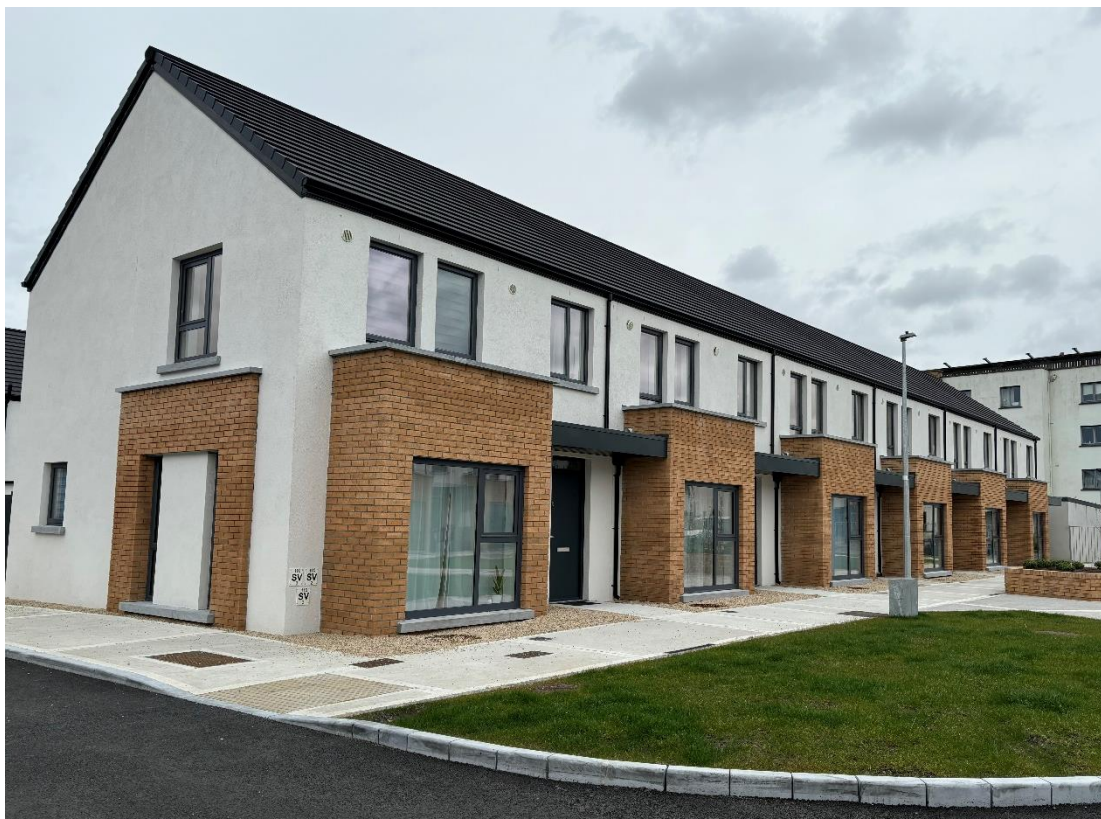
Photo – New local authority houses on Connaught Road, Longford

Longford County Council continues to add new houses to its housing stock of over 2,200 units. New houses are constructed to BER A3 standard. These houses are heated with electric heat pumps and are Near Zero Energy Buildings (NZEB). In 2024 a total of 82 houses were added. 29 in Longford town and 53 at other locations around the County.