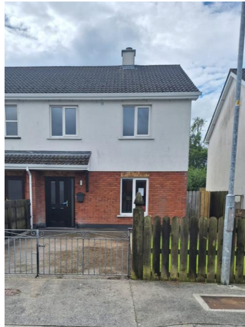
Photo – House retrofit Ardeevan, Longford-before & after