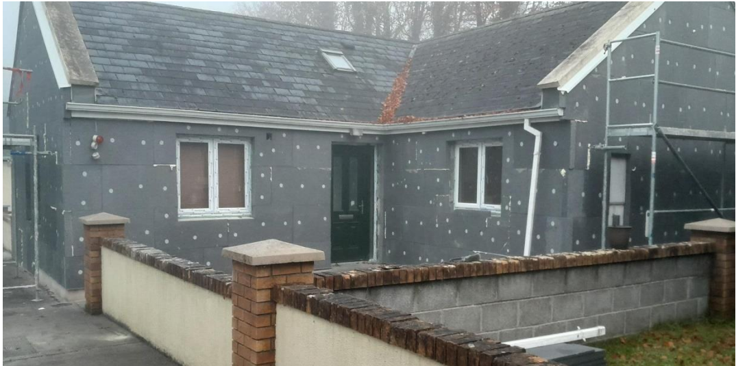
Photo – House retrofit Fairgreen View, County Longford.