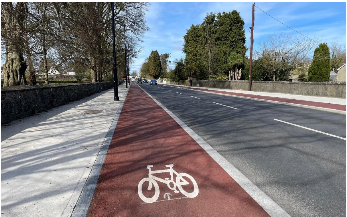
Photo – Cycle lanes on Battery Road