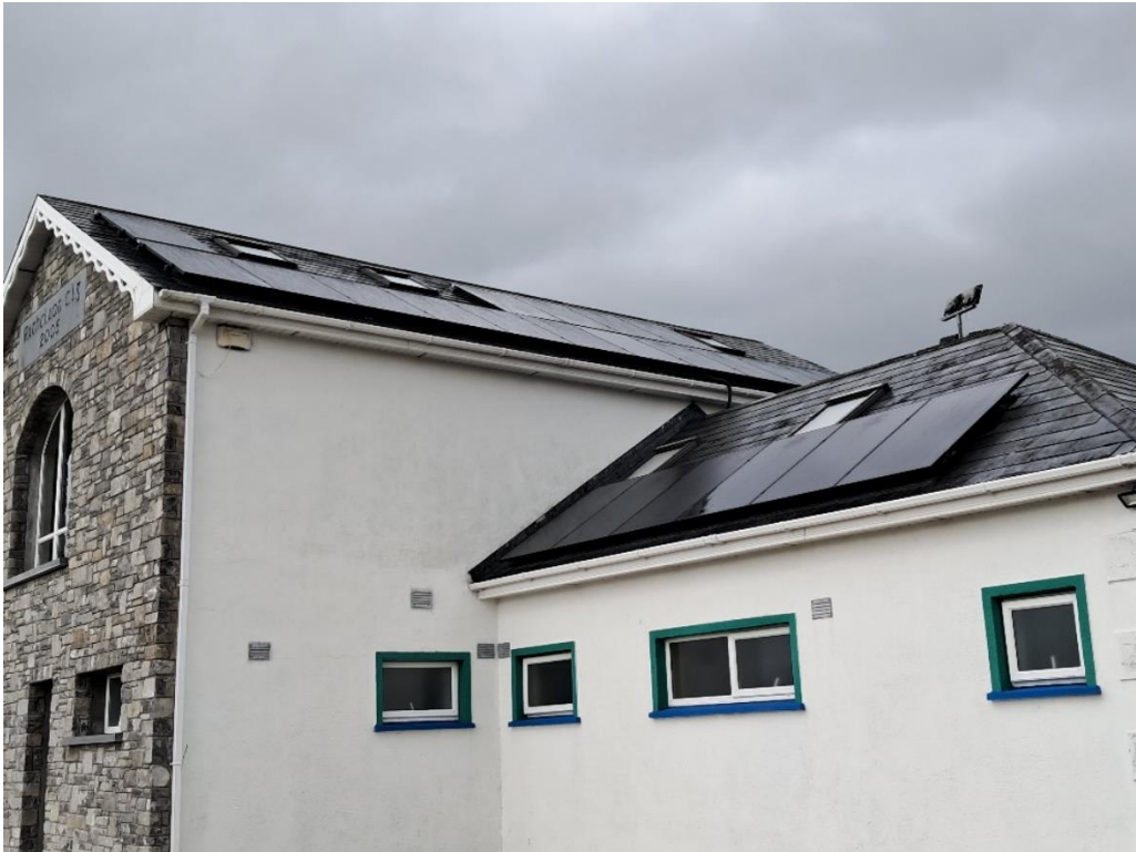
Photo – Rathcline GAA solar panels