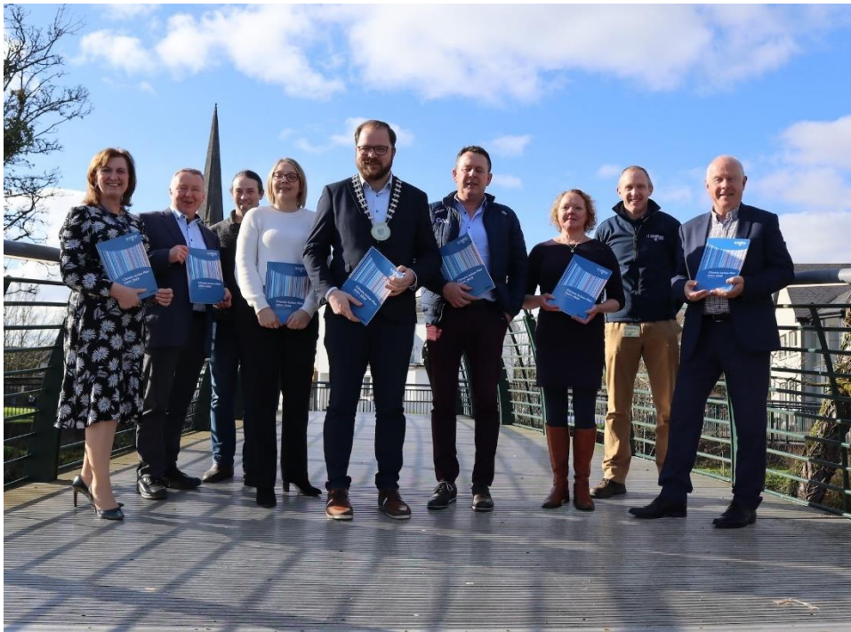
Photo - Longford Climate Action Plan Launch, 20 March 2024

Work on many of the Plans' actions was already underway at the time of the it's adoption. Highlighted below are some of the major Climate Action activities of 2024.