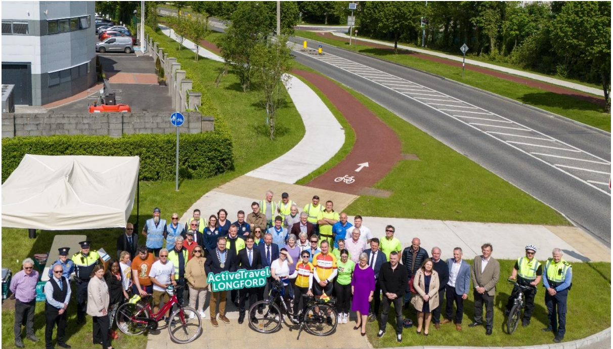
Photo – opening of cycle lanes on Ballinalee Road