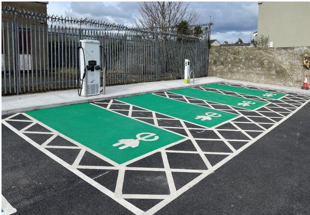
Photo – New EV charging station in Barrack Lane carpark, Granard.

In addition, Longford County Council participated with neighbouring counties in developing a regional EV charging strategy which is scheduled to be finalised in Q2 2025.