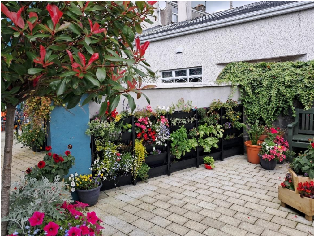
Photo – Community Garden, Lus na Greine