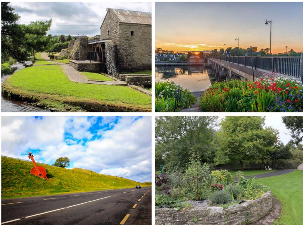
Clockwise from top right: Fig. 25. Drumlish Mill; Fig. 26. Lanesborough; Fig. 27. The Mall, Longford; Fig. 28. N5 Road Bypass, Longford

For further information in relation to Household and Commercial Waste Management, please see the “Waste Management (Segregation Storage, and Presentation of Household and Commercial Waste) Bye-Laws 2018.”