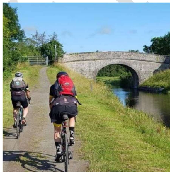
Fig. 1. Left: Kayaking on the Royal Canal. Fig. 2 Right: Cycling along the Royal Canal Greenway.

Individuals and businesses alike play pivotal roles in generating and disposing of litter conscientiously and this plan underscores that shared responsibility. To harness the power of community involvement, LCC actively seeks the cooperation of all sectors of society. Community members are not only the eyes and ears of our neighbourhoods, but also valuable partners in implementing and sustaining effective litter prevention strategies. By fostering a sense of shared responsibility, we empower residents to actively participate in local clean-up initiatives and educational programmes. Businesses, as integral partners of our community, are urged to contribute to the reduction of litter. Through responsible waste management practices and support for local initiatives, businesses can significantly impact the overall cleanliness of our environment. This plan encourages businesses to take ownership of their surroundings, contributing to a cleaner, more attractive community for