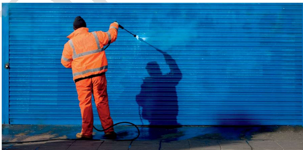
Fig. 14. Graffiti Clean Up

The prevalence of graffiti on walls, hoardings and buildings detracts from the visual amenity of towns and villages. Very often the sight of graffiti causes people to unfairly form negative impressions about particular areas and neighbourhoods.