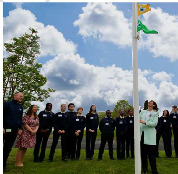
Fig. 8. Left: Green School Flags being presented by Longford County Council Environmental Awareness Officer.