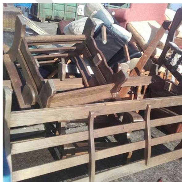
Fig. 22 & 23. Large, bulky waste collections have proved to be very successful in County Longford.