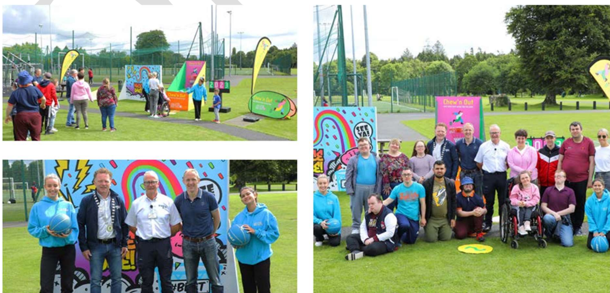
Fig. 15, 16, & 17. Gum Litter Taskforce recent visit to Longford

LCC is involved in rolling out the programme and supporting related initiatives locally in County Longford.