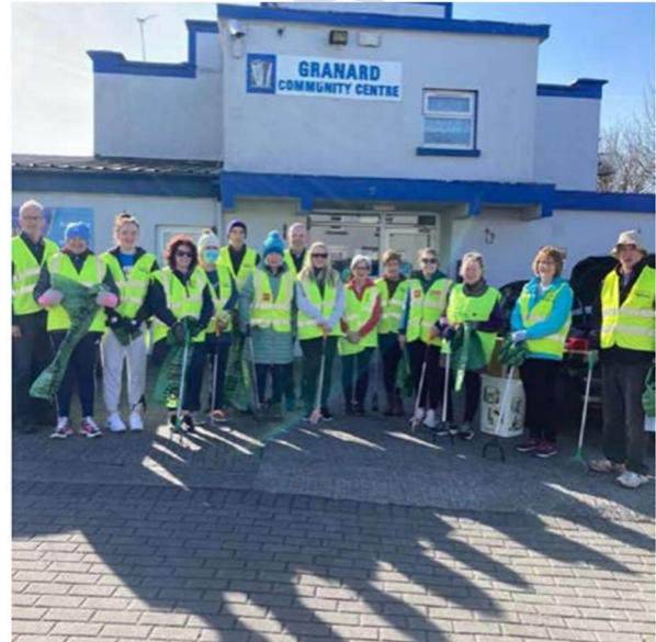
Fig. 21. Right: The community of Granard cleaning up their locality.

In developing relationship with voluntary bodies, LCC will: