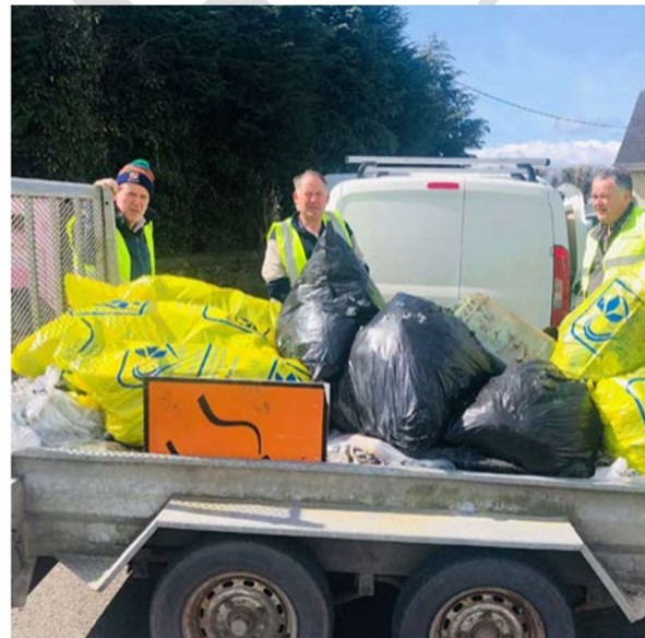
Fig. 11 & 12 Communities of Newtowncashel (Left) and Aughnaclyffe (Right) getting involved in Longford's Annual Spring Clean