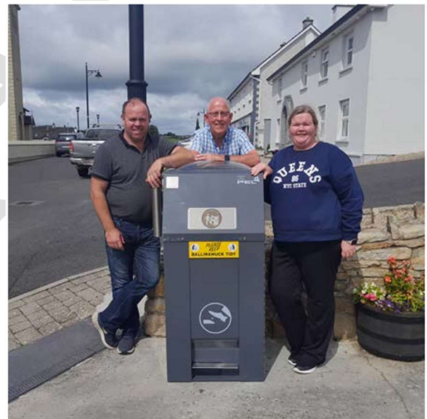
Fig. 10. Newly-installed solar powered bins in Ballinamuck village

For the term of this plan, a variety of options will be explored on how best to encourage responsible behaviour relating to litter disposal. Where requests for additional litter bins are received, LCC will consider the options available to it. Where litter bins are provided, they will be of a type and quality that best prevent the creation of litter and discourage their misuse or abuse.