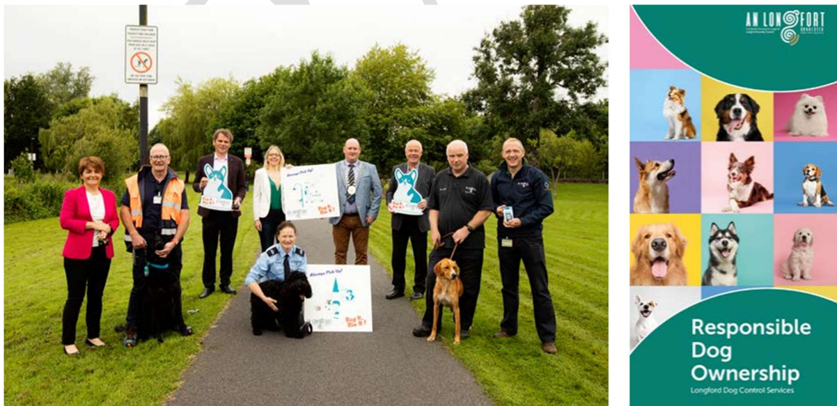
Fig. 18. Left: A recent Longford dog fouling campaign.

To provide information on responsible dog ownership, LCC has developed a Responsible Dog Ownership leaflet, which is available at its main offices, libraries, and other public buildings. Copies of the leaflet will be distributed as part of the Dog Fouling Awareness Campaign.