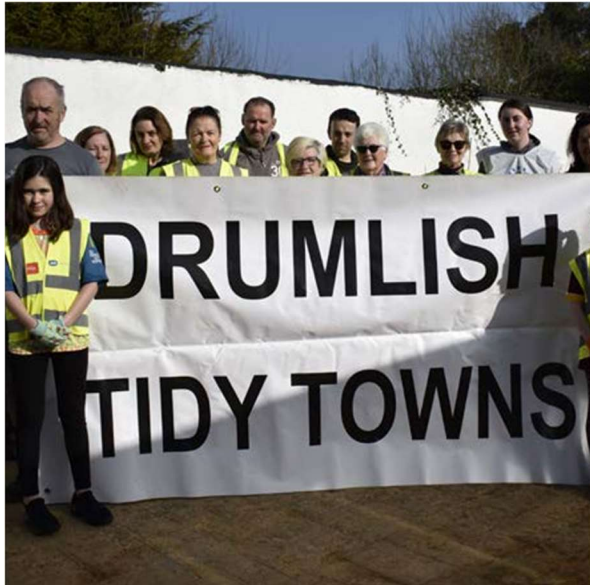
Fig. 20. Left: Drumlish Tidy Towns getting involved in a community clean up.

LCC recognises that community support is vital if the issue of littering is to be dealt with successfully. LCC acknowledges the ongoing efforts that are being made by concerned individuals, local community groups, Community Development, businesses, and Tidy Towns Committees working to tackle the litter problem at local level. LCC will assist local communities in their endeavours to combat the litter problem and will continue to support and encourage community-based initiatives.