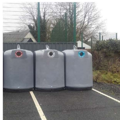
Fig. 13. A bring bank site in County Longford

Littering regularly occurs at locations where Bring Bank facilities are located. Costs are incurred by LCC, in relation to the collection and disposal of such litter. Littering in the vicinity of Bring Bank facilities can threaten the continued provision of recycling facilities. Where offenders are identified, offenders are issued with Litter Fines and those who fail to pay are prosecuted. LCC will continue to monitor activity in the vicinity of its Bring Bank Sites and will do whatever is necessary to discourage offenders.