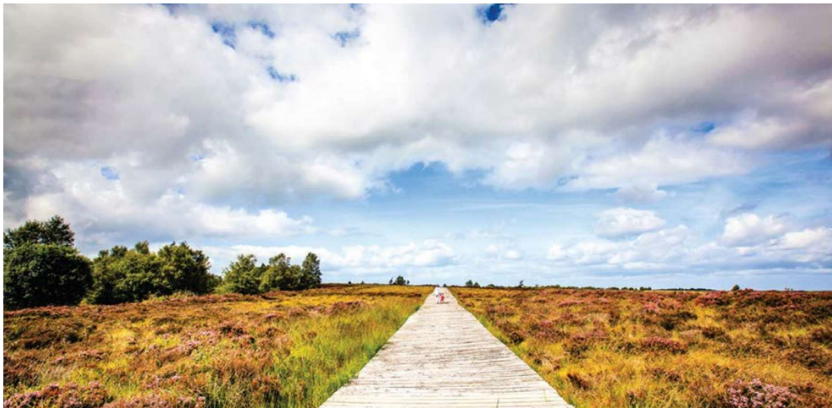
Fig. 3. Corlea Bog Trackway

all. Outlined within this plan are the objectives and actions pertaining to awareness, prevention, control, and enforcement of littering for the duration of this plan.