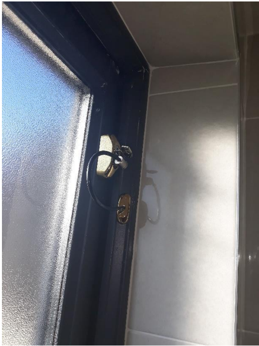
Non-Compliant Window Restrictors