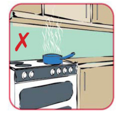
Page 2 of 4