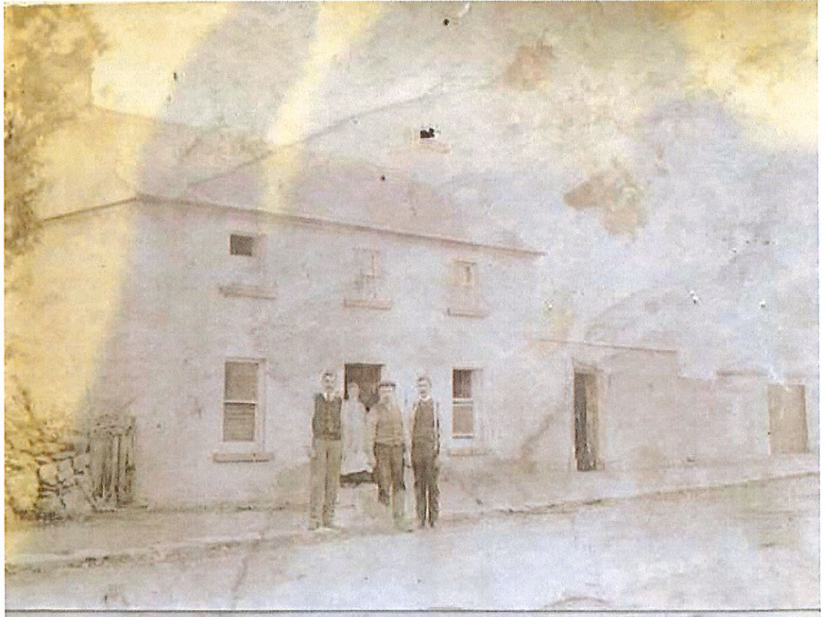
Appendix 1 – Original House (1909)