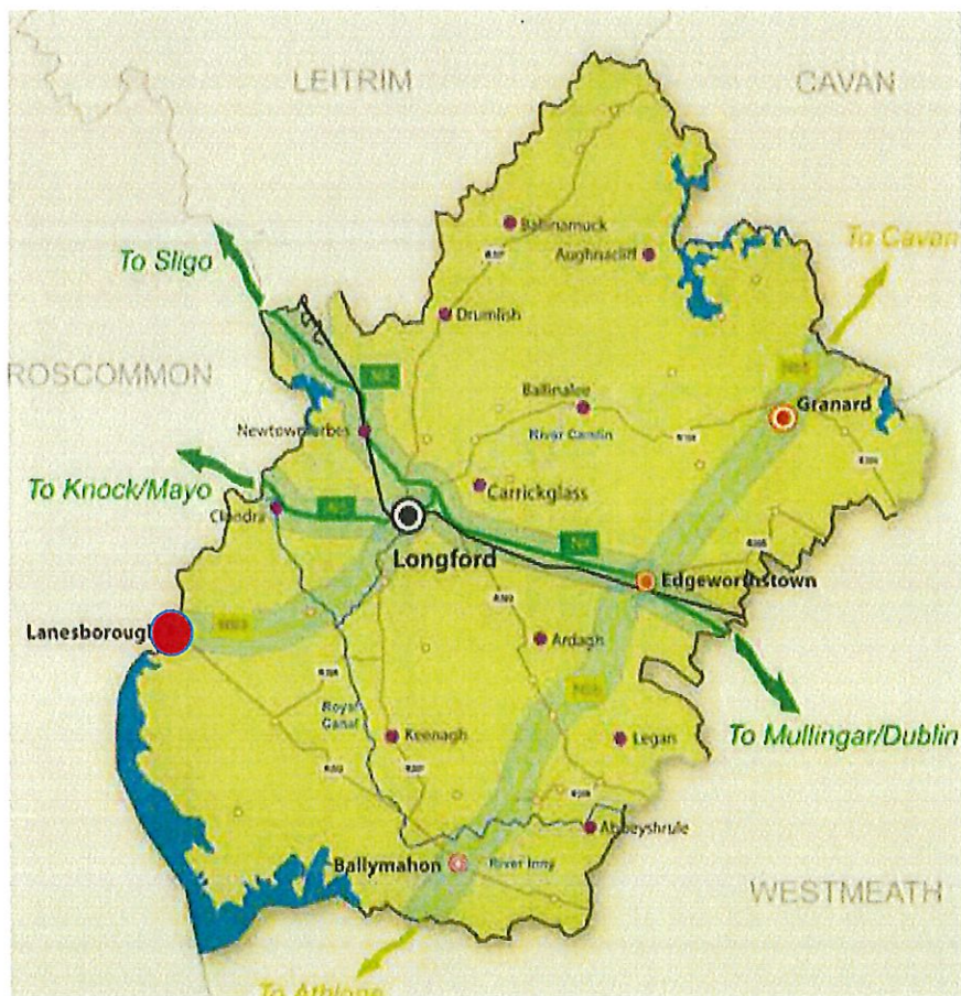
Longford County Map

The subject site is located within the Development Envelope of Lanesborough and zoned at present for Residential & Industrial/Alternative Energy under 2015 – 2021 and in the Draft 2021-26 maps. The site is service with mains sewerage and mains water.