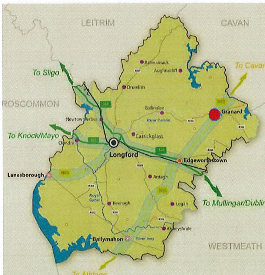
Longford County Map

The subject site is located within the Development Envelope of Granard and zoned for Social/Community/Education under 2015 – 2021 and in the Draft 2021-26 maps. The site is service with mains sewerage and mains water.