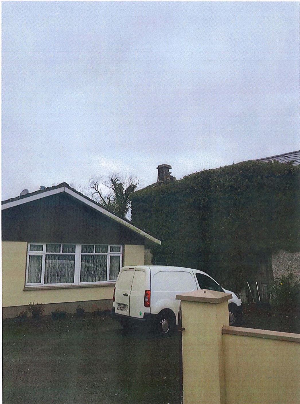
Proximity of family home to unstable building needs to be address. Removal of the ivy not possible with the condition of structure.