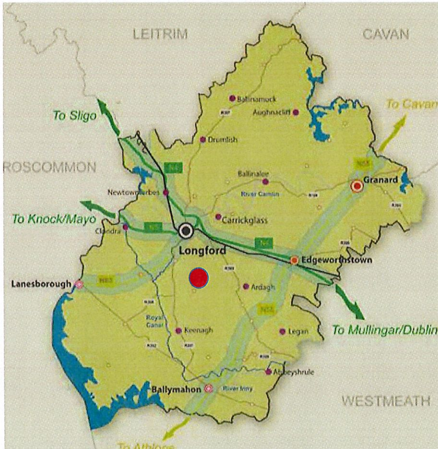
Keel in Longford County Map

LCDP 2015 – 21 identifies Keel House, KEEL Moydow, Co. Longford on the National Inventory of Architectural Heritage.