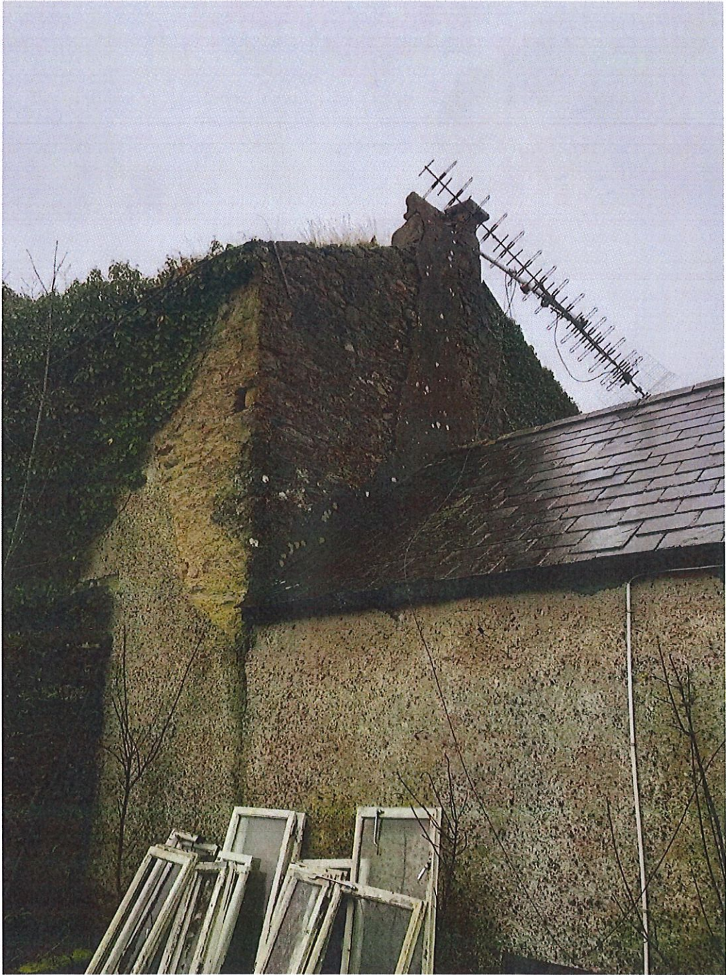
Existing chimney and gable wall close to family home needs to be removed