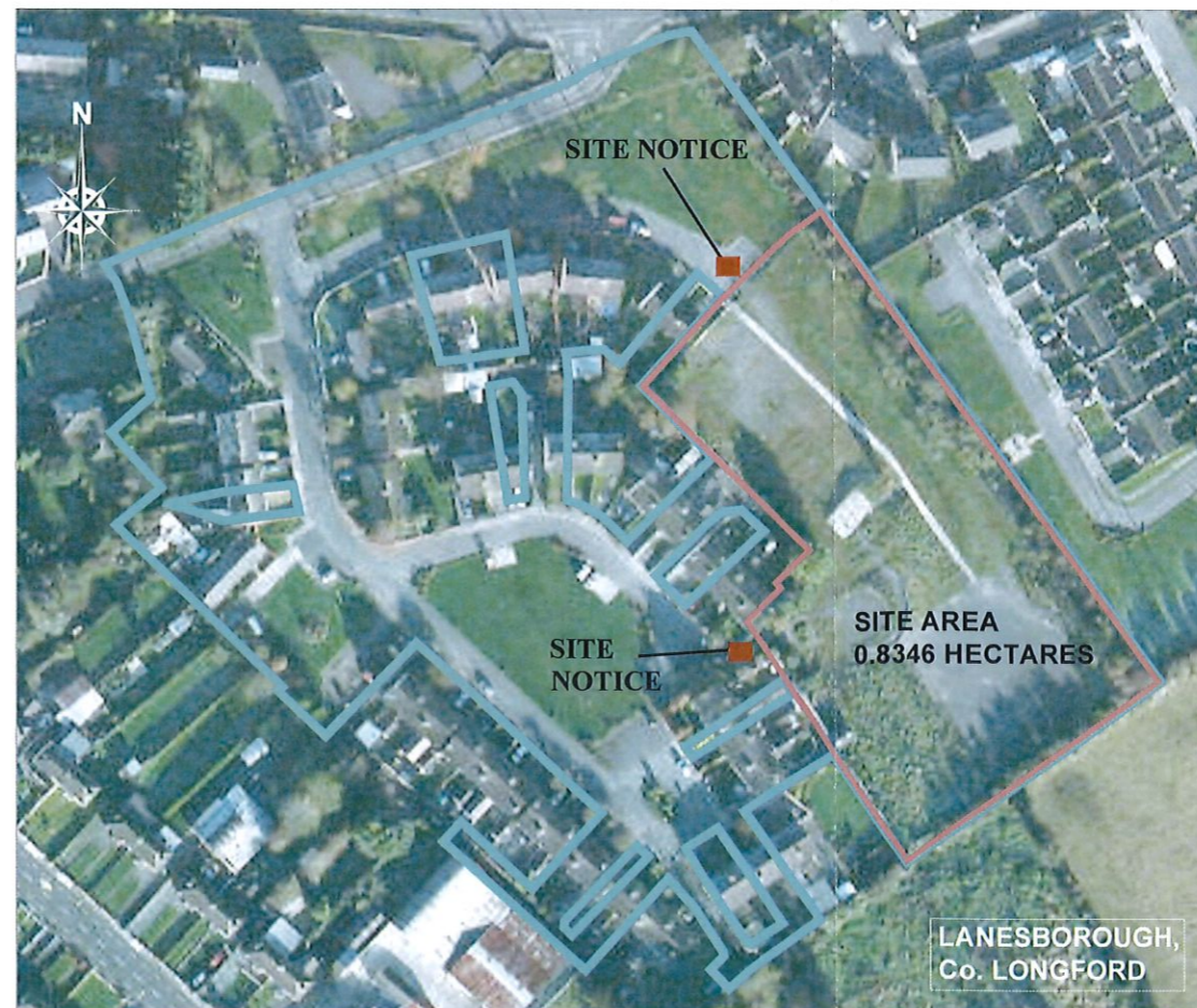
SITE LOCATION & LANDHOLDING MAP - AERIAL VIEW Scale 1:2,000