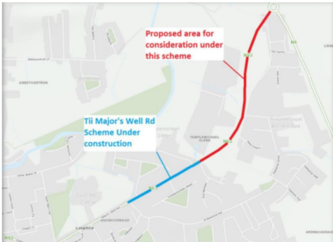
Extent of Proposal Works Outlined in Red

Longford Co. Council obtained funding through a TII Safety Scheme for the provision of footpath and cycle track on the Majors Well road section of the N63 from the Oakvale road to the TempleMichael terrace Junction, a distance of approximately 500m and construction works are underway since October 2021. This proposed project looks at the continuation from where the cycle and pedestrian paths terminate under the TII scheme, onwards along the N63 Ballinalee Road to the N4 junction indicated in red below