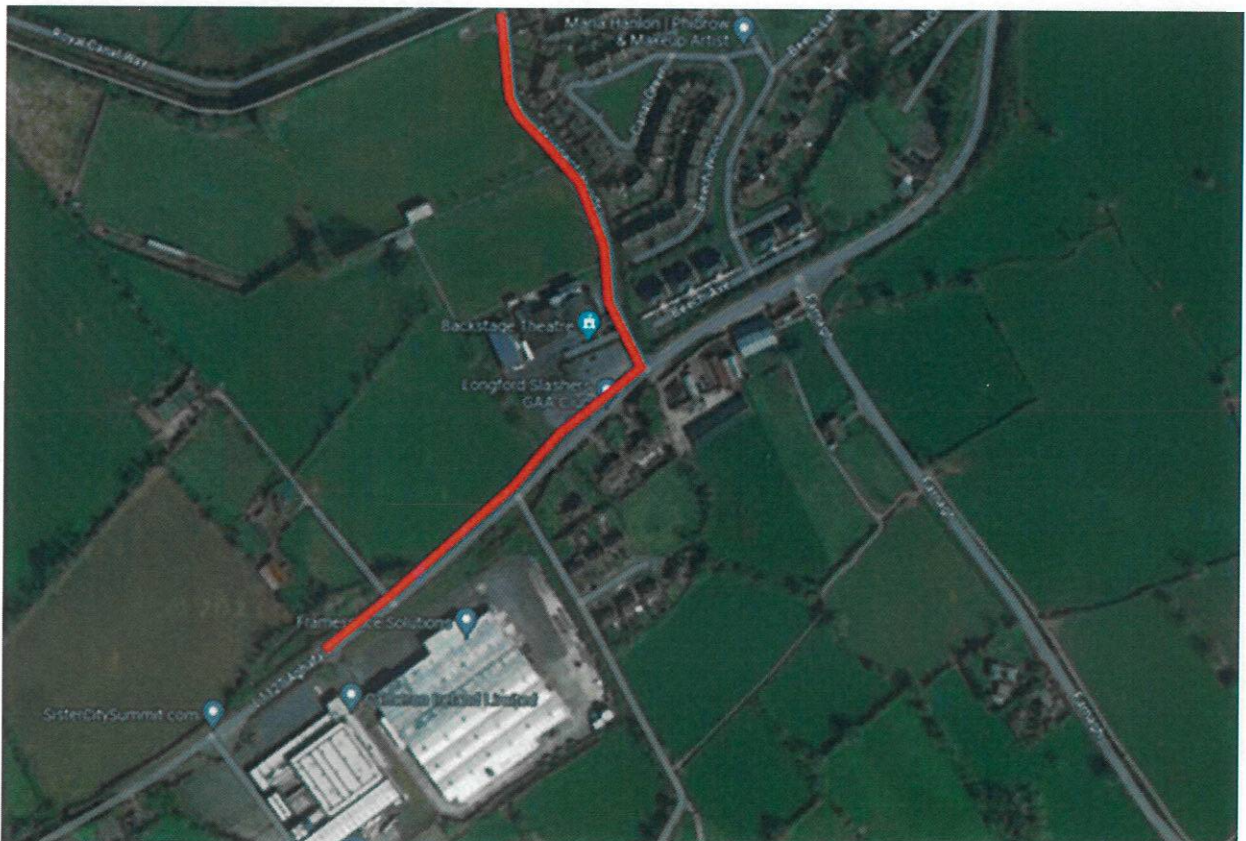
Fig. 1: Aerial image of subject site with extent of proposal works marked in red

The site is located along the L-1172 connecting the R397 to Longford Town on the portion of road from the existing GAA grounds to the existing factories. There are existing sections of path up to the GAA pitch and it is proposed to continue this onto the existing factory site and create a link onto the Royal Canal as outlined above