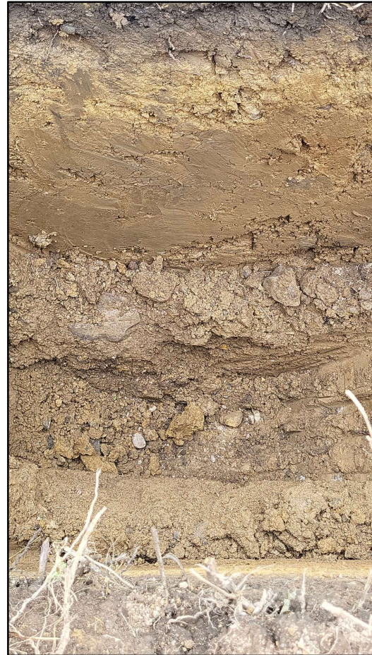
Fig. 2 & 3. (Above) A trial pit depth of >2.5m was achieved with no evidence of groundwater at depth.