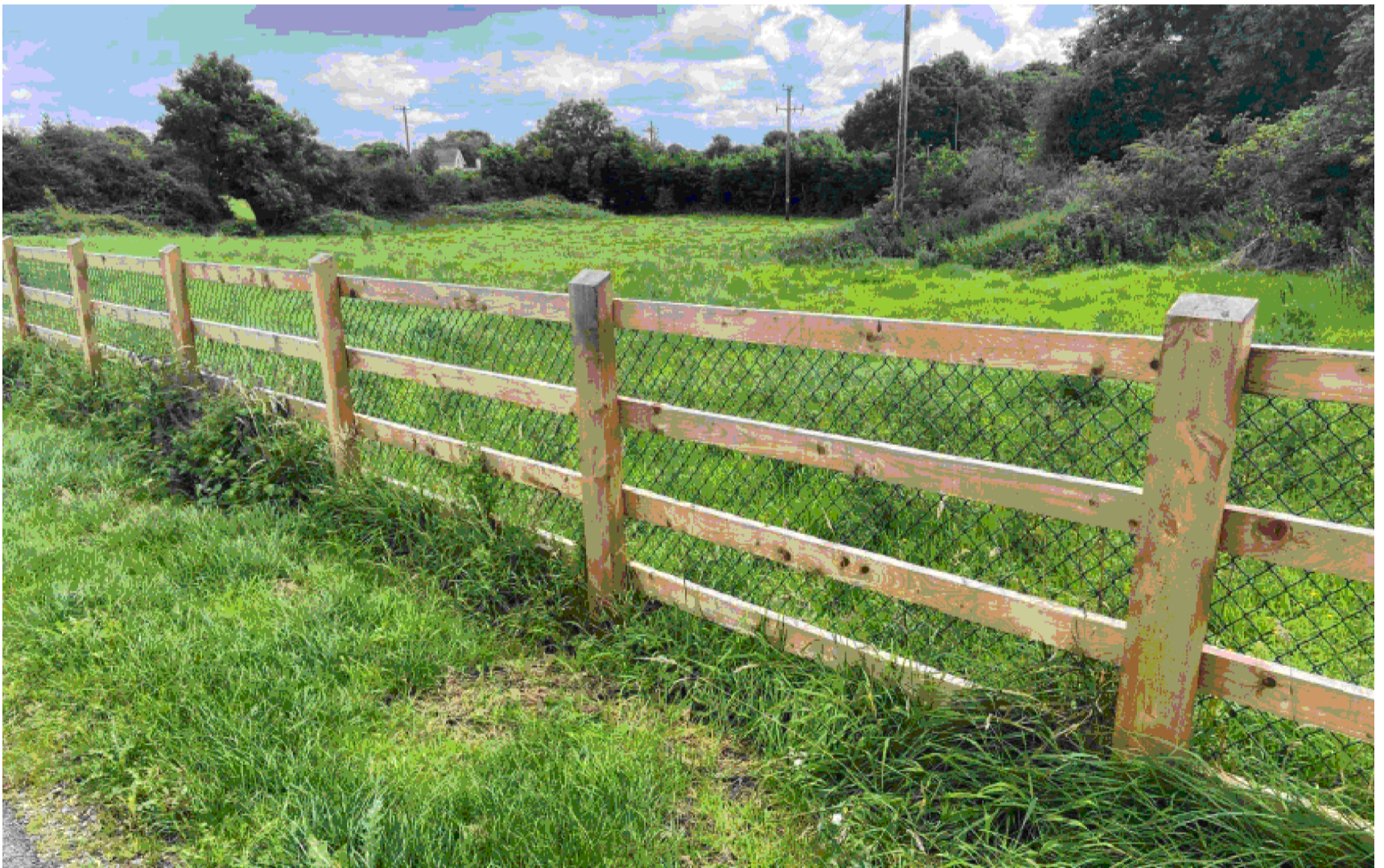
TYPICAL TIMBER POST & RAILING FENCING WITH MESH EXAMPLE

• THIS DRAWING TO BE READ IN CONJUNCTION WITH ALL OTHER DRAWINGS AND ALL OTHER RELEVANT DRAWINGS AND SPECIFICATIONS. • DO NOT SCALE THIS DRAWING USE FIGURED DIMENSIONS ONLY. • OS MAP NUMBER: 1932, 1872