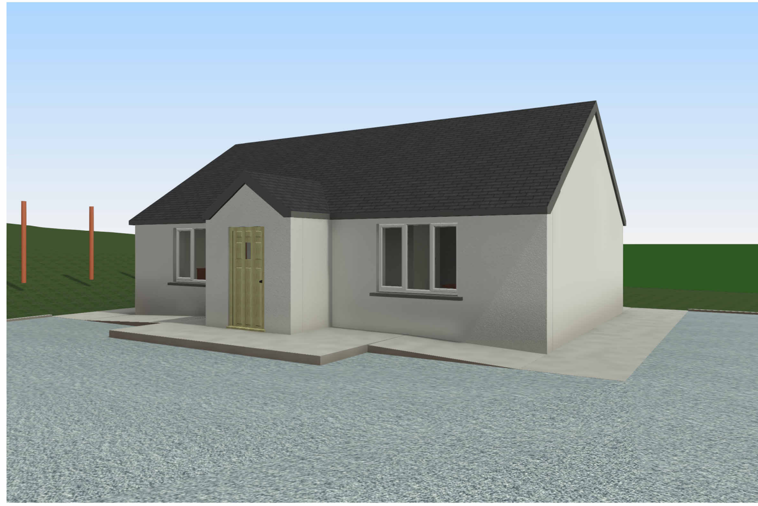
4 Front Elevation