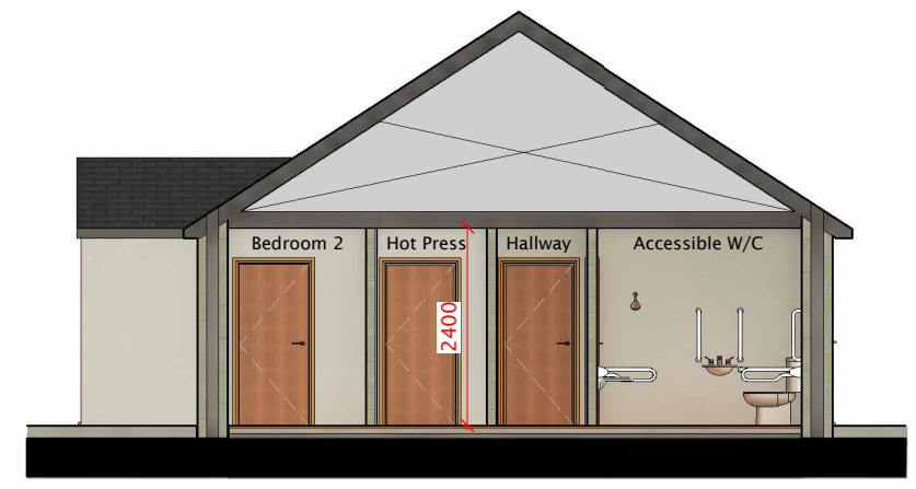
2 Cross Section 1 : 100