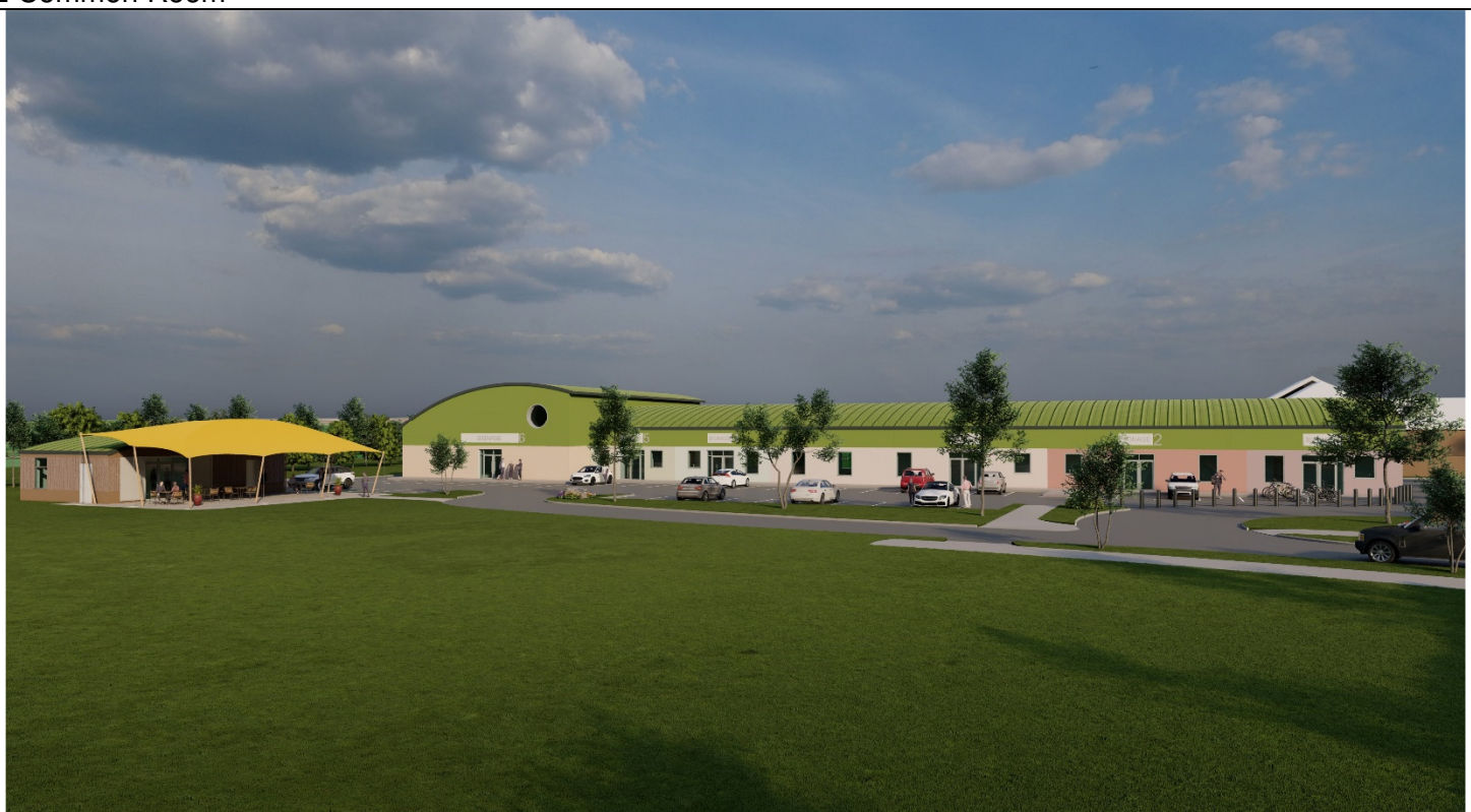
3 Food Hub 4 Common Room & Food Hub