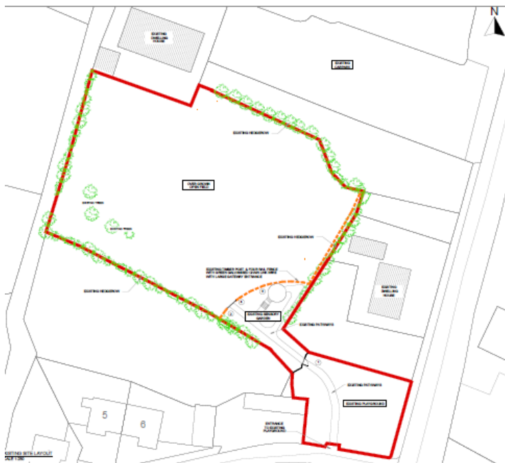
Existing site layout

The site is bounded to the east by the L1056 and a residential site, to the north by the Holy Trinity Church and its associated car park and to the west by a small woodland and to the south by the Camlin View residential area. The land-use surrounding the site is mixed use.