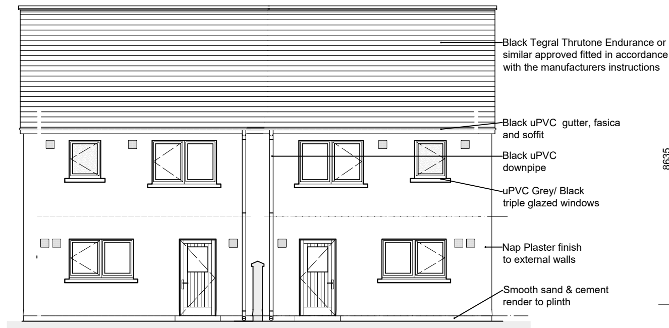
HT1 Rear Elevation 1:100