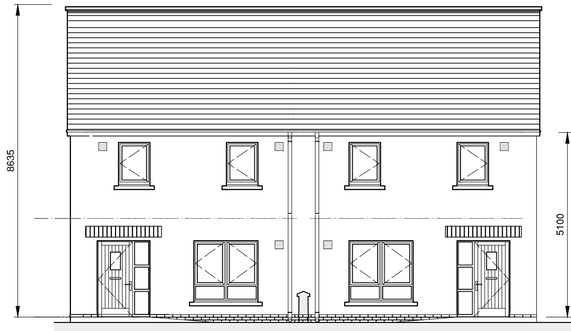
HT1 Front Elevation 1:100