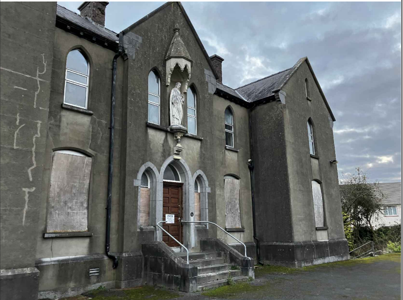
3. Convent of Mercy (Day Care Centre) front elevation view.