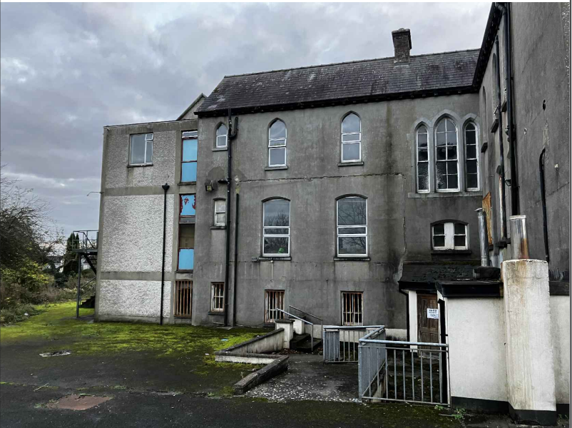
4. Convent of Mercy (Day Care Centre) side elevation view.