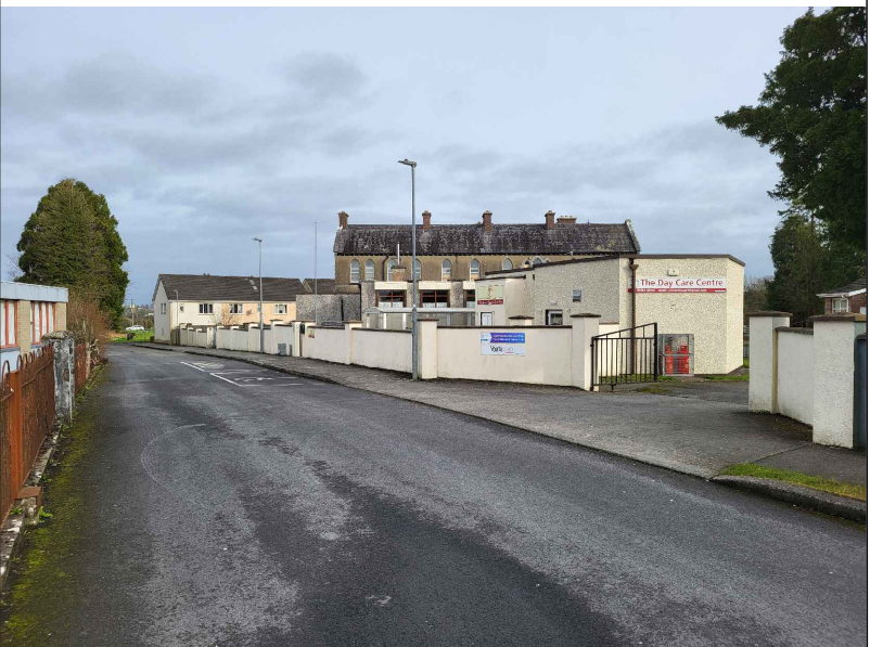
1. View of Convent of Mercy (Day Care Centre) main entrance.