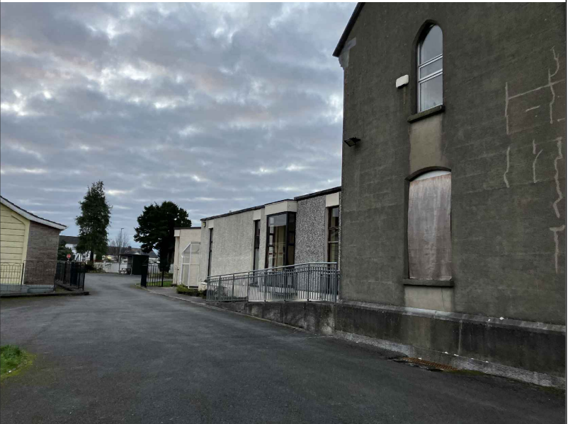
2. Internal view of Convent of Mercy (Day Care Centre) main entrance.