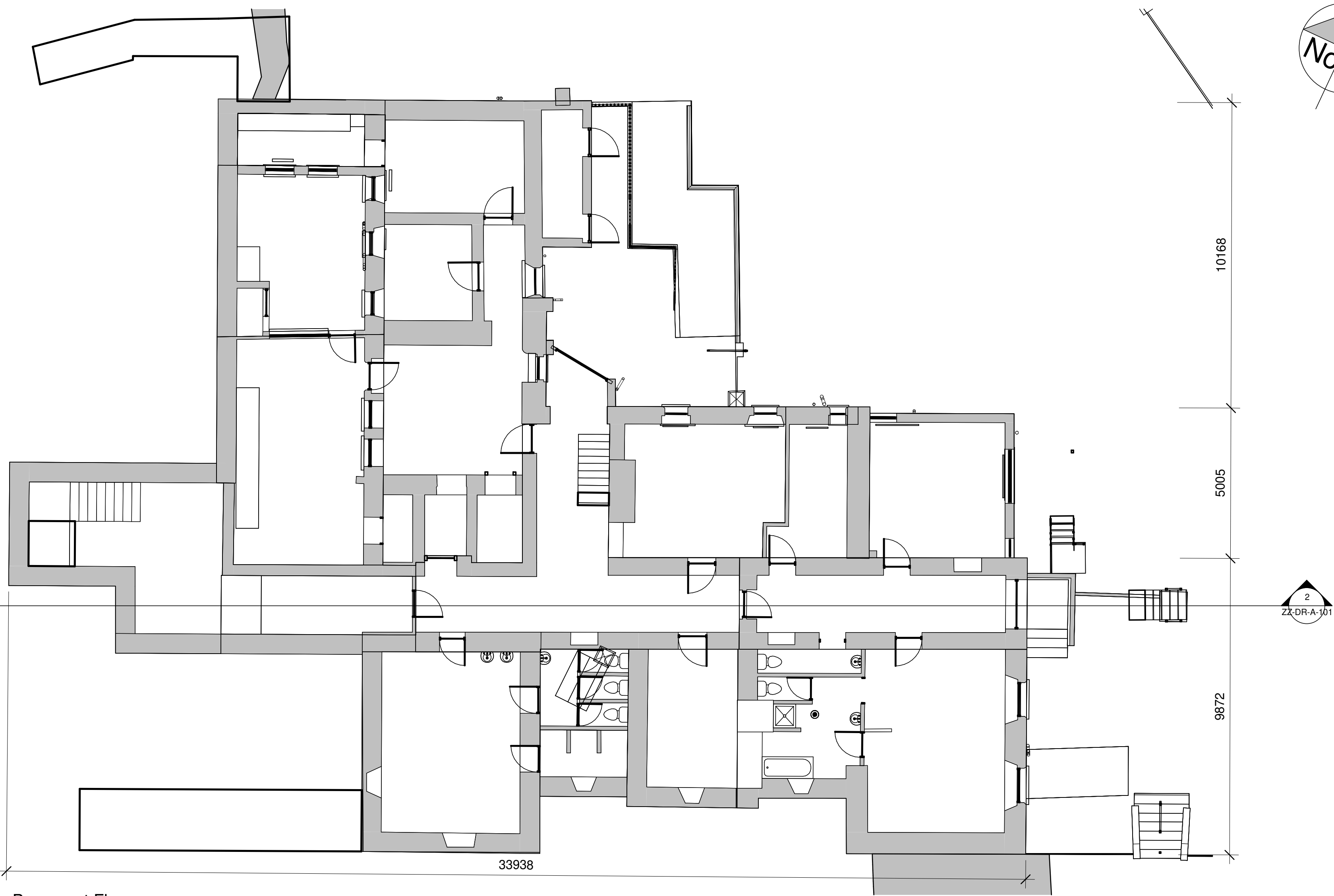
Basement Floor 1 : 100