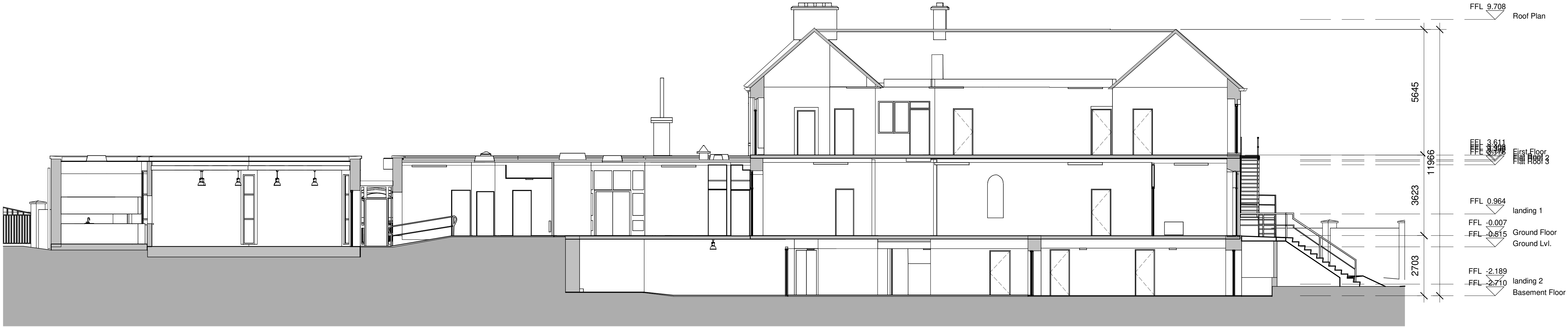
Section 3 1 : 100