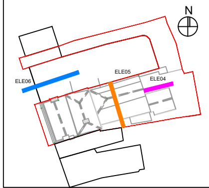
KEY PLAN: ELEVATION NO's (NTS- Reference only)