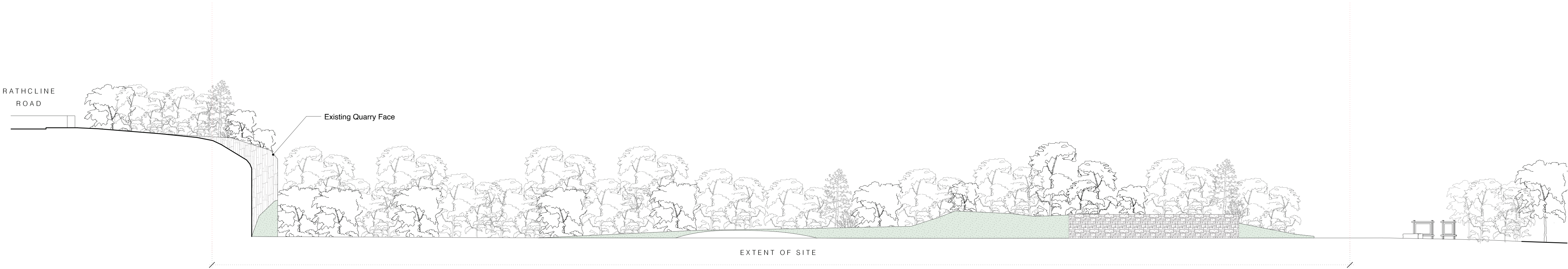
02 EXISTING SECTION B B Scale 1:200