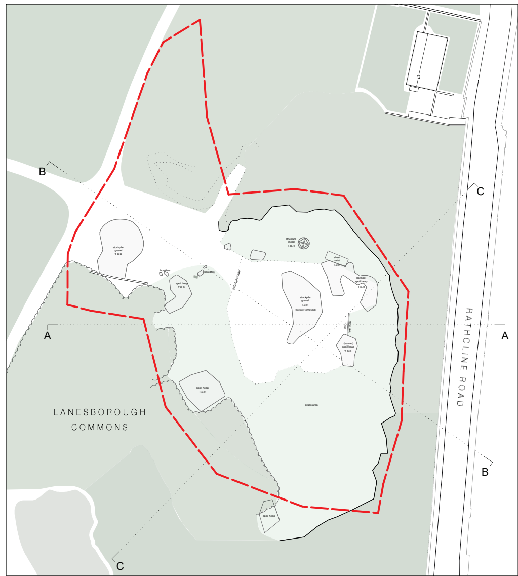
04 KEY PLAN Scale 1:1000