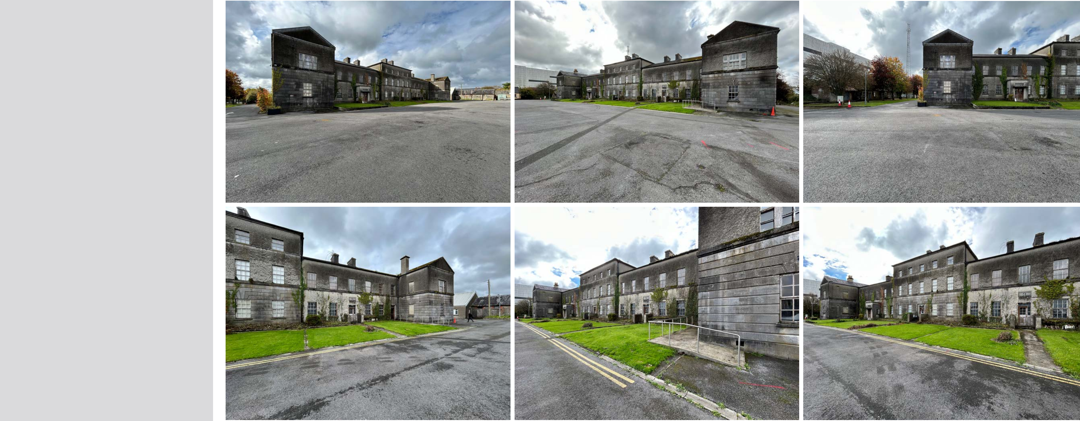
Officers Building _ East Elevation Oblique views of the Officers Building east elevation from the former parade yard. Note alterations to existing frontage including ramped entrance route adjacent to and extending across the front elevation of the northern wing.