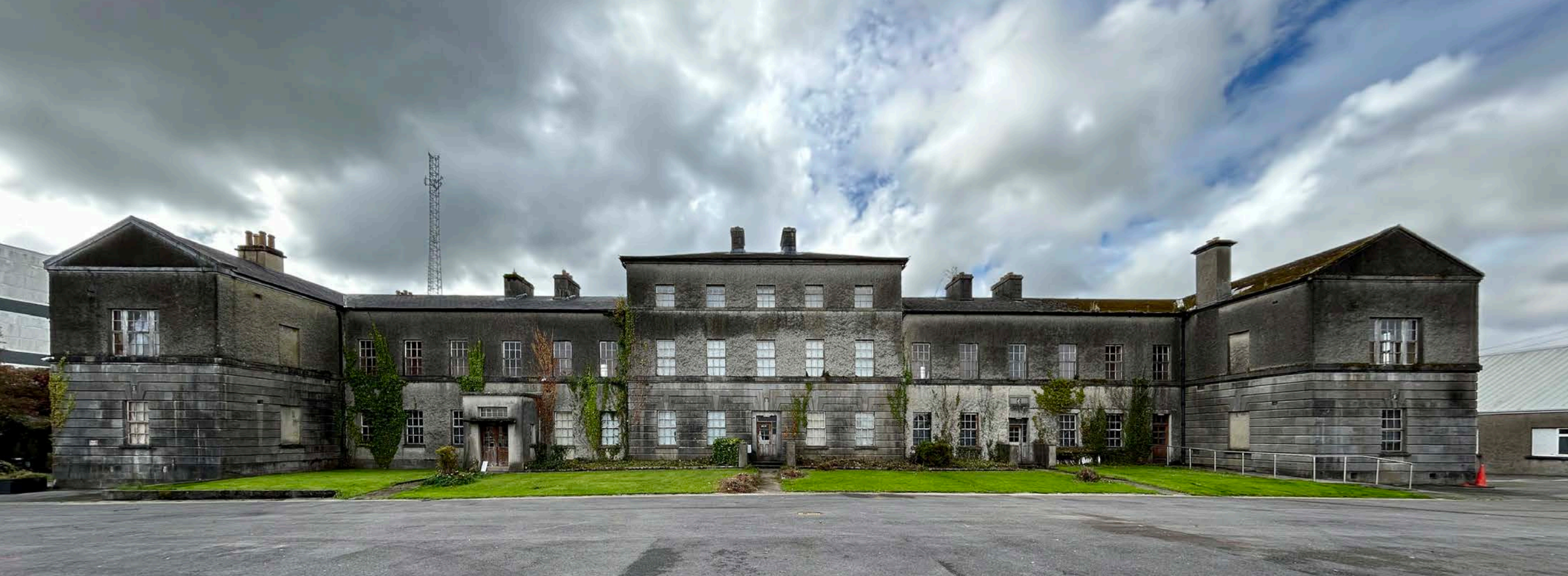
Officers Building _ East Elevation View of the Officers Building east elevation from the former parade yard. Note alterations to existing frontage including infilled window openings, projecting porch to the front southernmost entrance, replacement of ground floor window with door opening adjacent to northern wing.