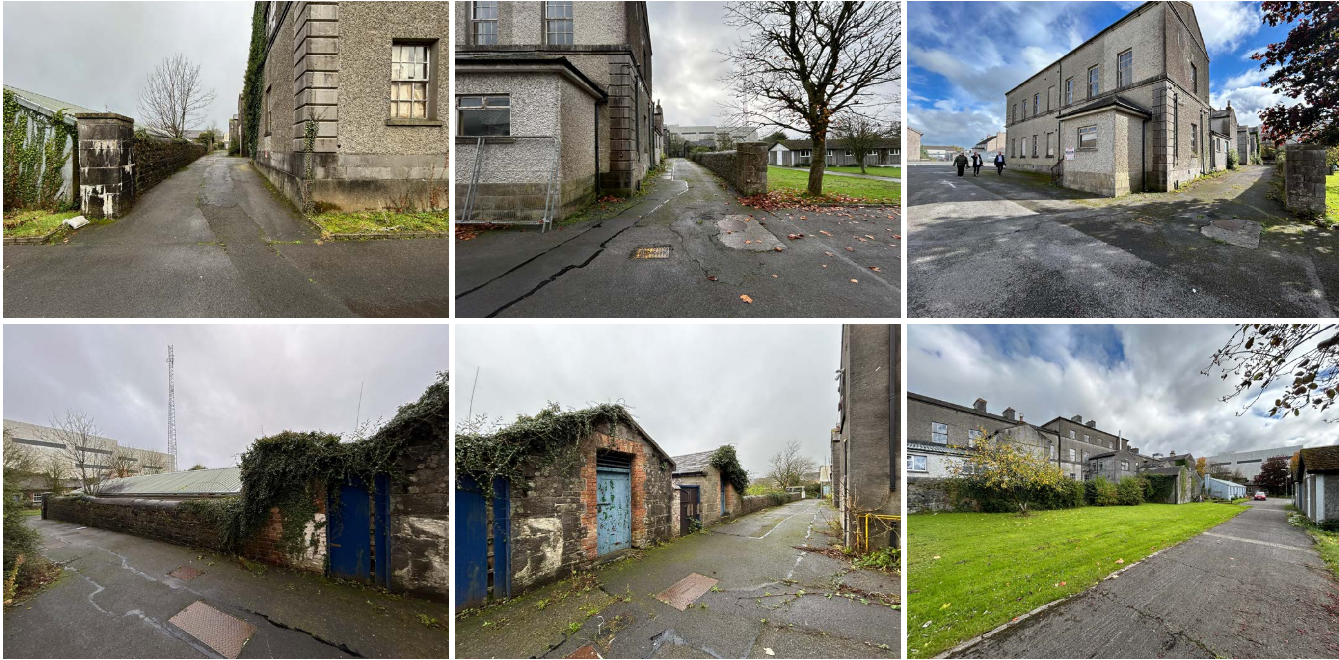
Officers Building _ Western Frontage and Adjacent Lands Views of the laneway that extends across the length of the west elevation to Officers Building showing stone boundary wall and small stone outbuildings. To the west of the boundary wall an open area is situated with single storey accommodation buildings of 20th century construction, one of which sits within the application site.