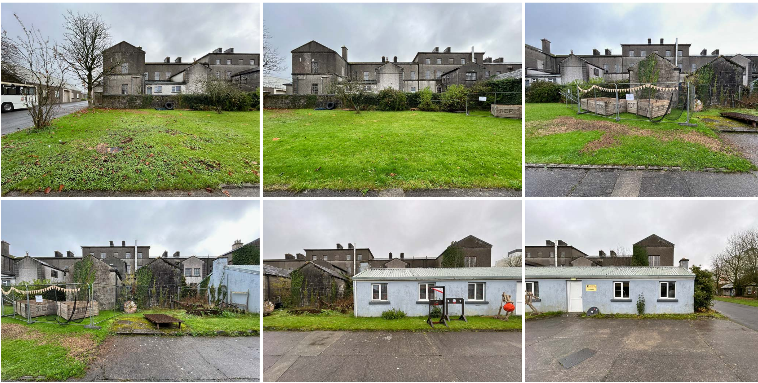
Officers Building _ Western Context To the west of the Officers Building are extents of open land with two small stone outbuildings and a single storey building. The Officers Building west elevation is partially visible over the roofs of and between these structures.