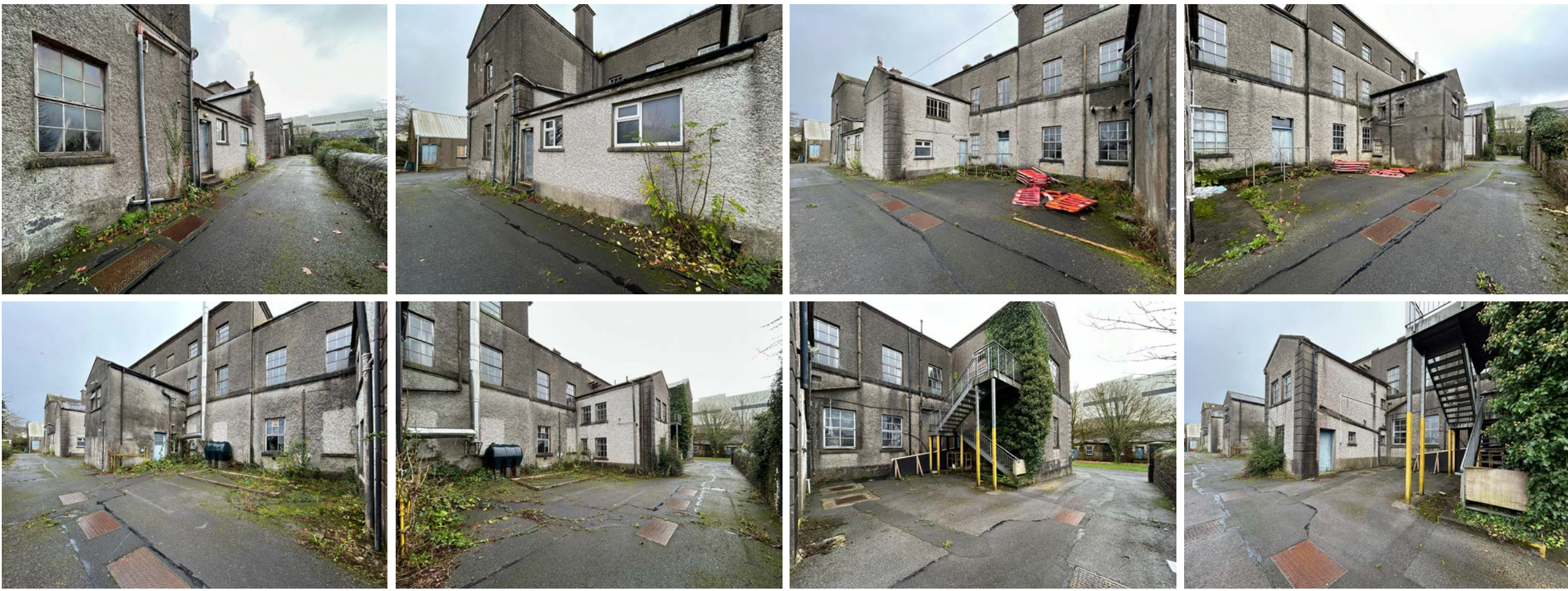
Officers Building _ West Elevation Oblique views of the Officers Building west elevation from the rear laneway showing projecting two-storey annexe structures. To the northern end the northern wing and northern annexe have been conjoined by the construction of a single storey flat-roofed infill with rear access door and two small windows. A fire escape stair is located adjacent to the