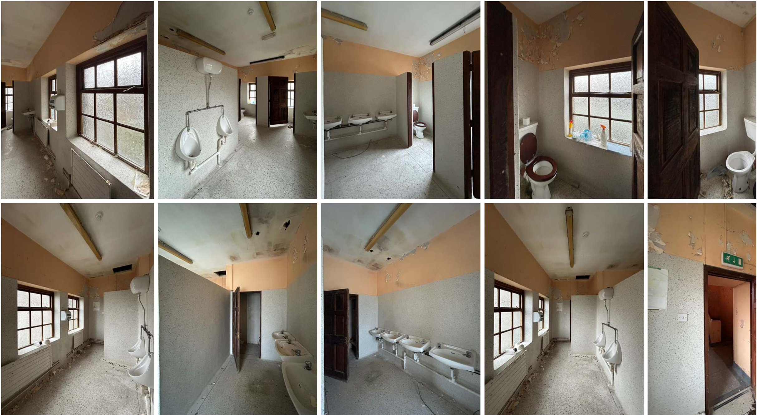
BATHROOM ANNEXES TO BE CONVERTED TO ARCHIVE STORAGE FOR MUSEUM