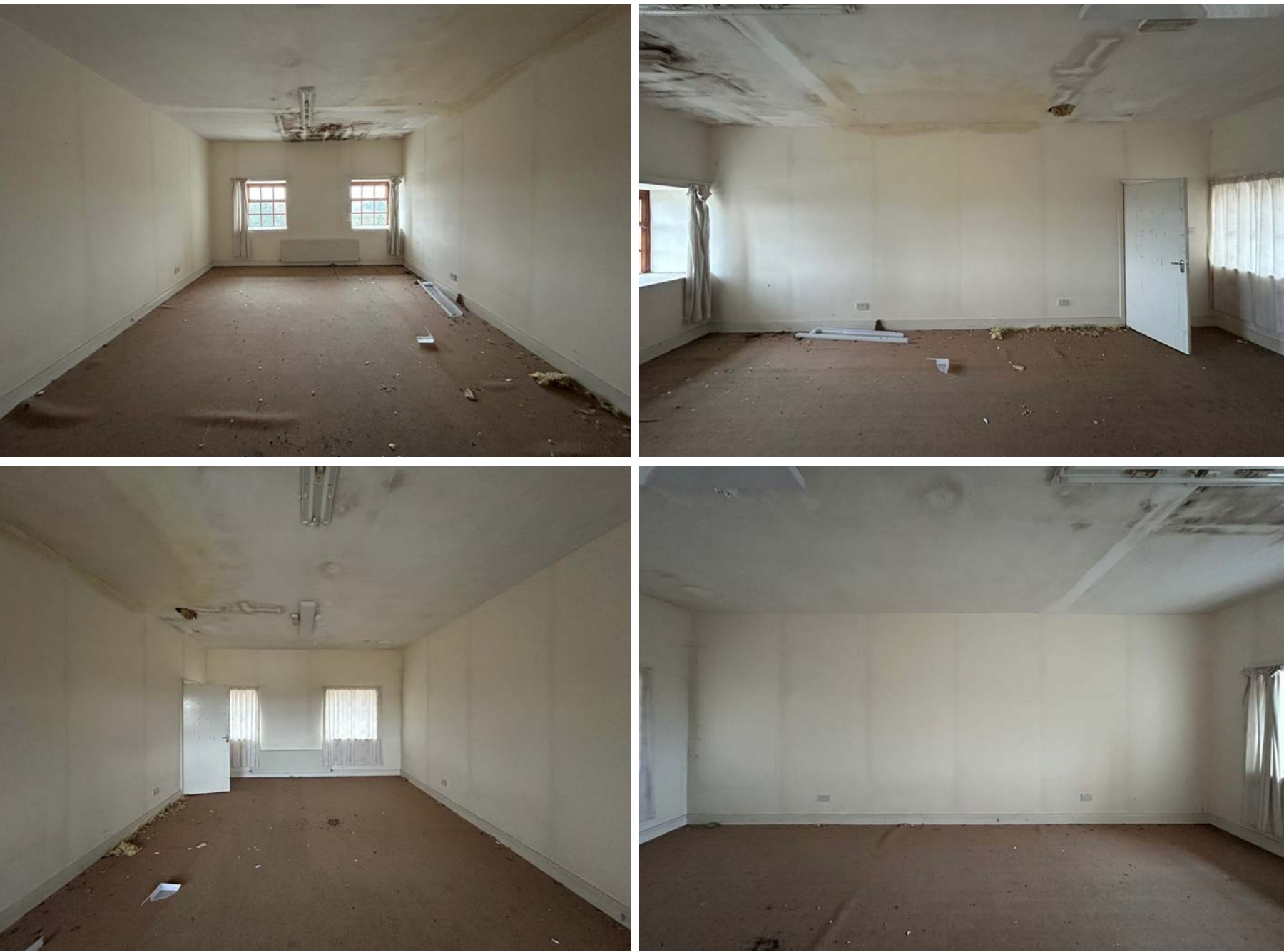
2ND FLOOR ROOMS TO BECOME FLEXIBLE USE -PODCAST/TECHNOLOGY SUITE