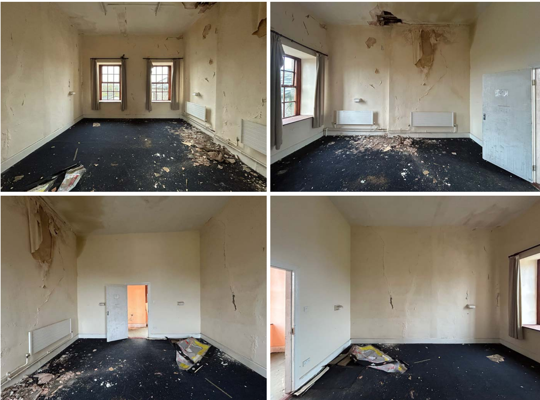
1ST FLOOR FORMER OFFICE TO BE CONVERTED TO FLEXIBLE USE