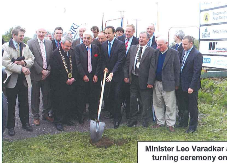
Minister Leo Varadkar at the sod turning ceremony on 12th May