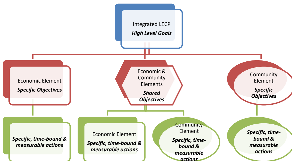
Figure 4: Plan Evolution

Longford LCDC and Economic Development and Enterprise SPC welcomes feedback and comment on this Socio-Economic Statement and associated high level goals, and also in relation to the suggestion of possible objectives and specific actions, or on any other issues you believe should be included in the LECP.