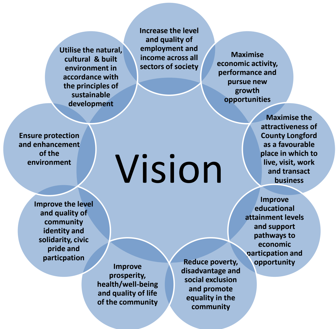
Figure 3: Integrated High Level Goals